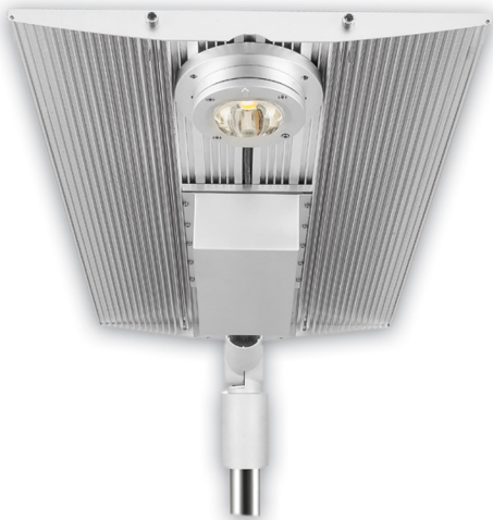
Bottom View (street light side)